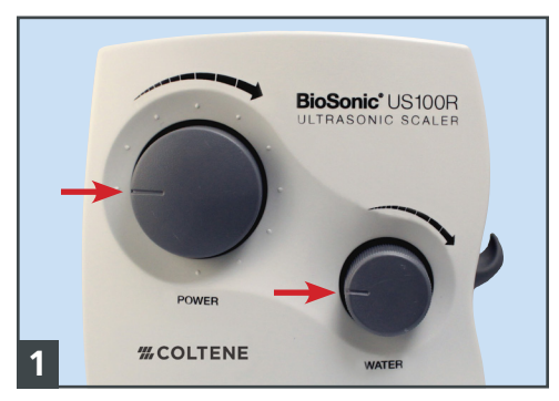
Ensure power and water are set to lowest position (fully counter-clockwise).