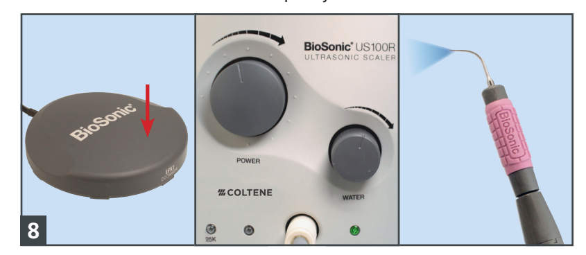
Depress foot pedal and adjust power and water to obtain ideal mist for scaling.