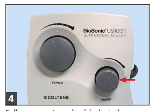
Fully open water valve (clockwise).