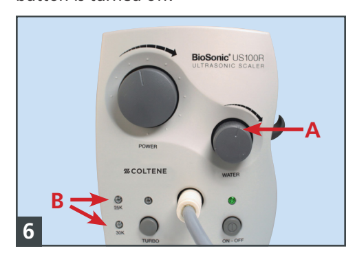
A. Reduce water to 1/4 open, leave handpiece full of water; remove foot from foot pedal, B. frequency select LED's