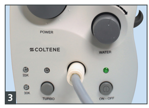
Insert handpiece connector into the front of the unit. Turn on unit, ensure turbo button is turned off.