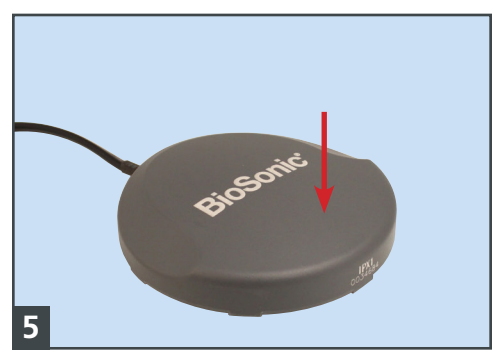
Depress foot pedal and verify cool water is flowing through the handpiece.